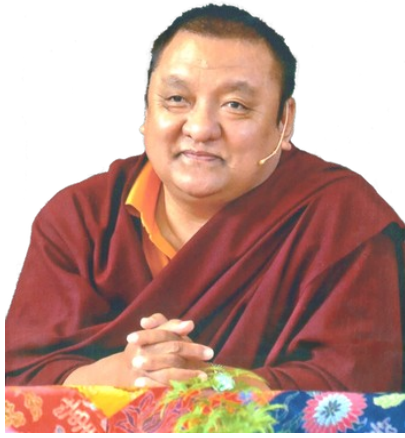
The picture shows the 14 th Shamarpa

In 1992 the division of the Karma Kagyu tradition took place between the highest ranking Lama, Shamar Rinpoche and the not quite so high Lama, Situ Rinpoche and his conspirators, among who was the government of the Communist Chinese Empire.