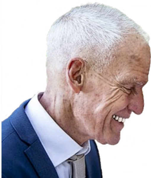
The picture shows Lama Ole Nydahl as an old man.

Ole Nydahl teach Mahamudra as Buddhist view to some extent, but he does not explain Mahamudra as a meditation system.