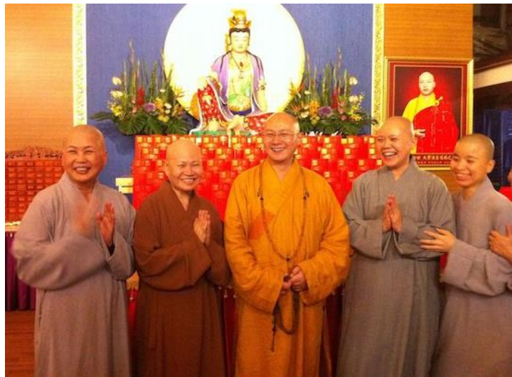
Framed picture of Ogyen Trinley wearing the clothes of Han monks, hanging on the wall of a Chinese temple (to the right of the photo)

What all these lamas have in common is that they are respected and revered in a very powerful relationship of spiritual allegiance, even at the risk of manipulation and the abuse of power, which is very difficult to counteract. In contrast, the relationship between Chinese Buddhists and their Han clerics, while very respectful, is much less devoted. So it took some time for the authorities in Beijing to get the measure of this difference between Tibetan and Han Buddhism.