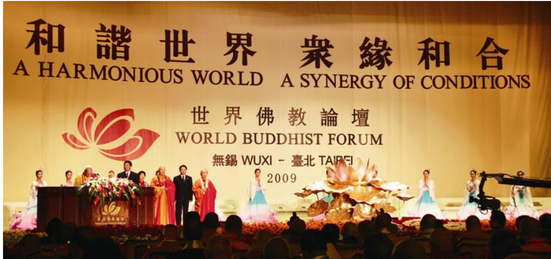
World Buddhist Forum 2009, held in Wuxi, China

China is now investing heavily in presenting itself as the defender and benefactor par excellence of Buddhism. The creation of the “World Buddhist Forum” should, in particular, be seen in this context: this outstanding triennial event, launched in 2006, is attracting thousands of participants from 50 different countries. Most recently it has taken place in Lingshan, a sort of Pharaoh-like Vatican for Buddhism, in Wuxi, less than an hour from Shanghai.