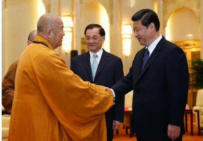
Hsing Yun greets President Xi Jinping in Beijing, January 2013

But even more importantly, in 1992 he engineered the “discovery”, and then the official recognition by SARA, BAC and the United Front, of one of the two “17th Karmapas” (“Karmapa” is a title that has been conferred on successive heads of the very influential Kagyupa branch of Tibetan Buddhism since the twelfth century) 3 . The Chinese-approved Karmapa’s short name is “Ogyen Trinley” and was said to be seven years old at the time of his recognition.