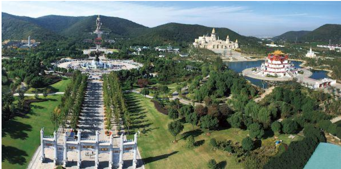
Aerial view of the Buddhist city of Lingshan

When you see the Dalai Lama's permanent smile and the recent self-immolations of young Tibetans, you would hardly think the Beijing regime was winning the battle on the Roof of the World. You'd be wrong. China is poised to succeed in winning the comradeship of Tibetan souls, not through re-education camps, but through Buddhism, seen as a common DNA of Chinese and Tibetans.